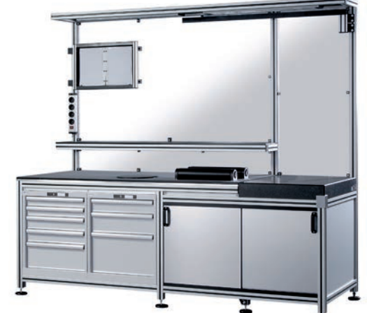
Measuring station with integrated granite desktop and turntable