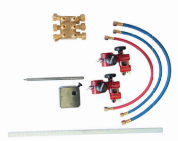
0870616 Extension kit for 2-torches